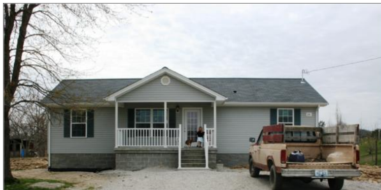
After: Kelly Sue, 4, on the porch of the Stranges' new Frontier home.

Through an award from NeighborWorks® America , Frontier Housing was able to provide the Stranges with additional funds to complete their financing package. These funds allow for low interest, fixed rate loans for the replacement of dilapidated, older mobile homes that are extremely inefficient creating high utility costs and substandard living conditions.