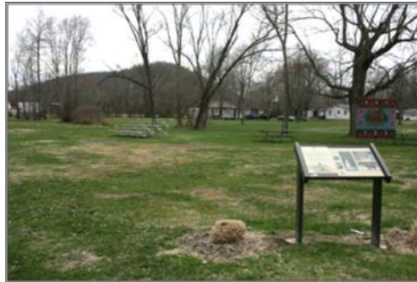
The City of Salt Lick's "green space"—future site of a public performance platform.

Frontier is excited about an upcoming project that will beautify and solidify one of our rural communities and draw attention to the mission of Frontier and NeighborWorks® America. We will honor NeighborWorks® Week by hosting a community celebration in The City of Salt Lick, located in Bath County, KY.