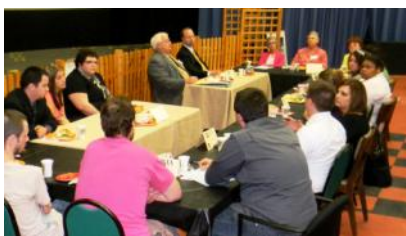
AmeriCorps Members and community young people meet with AmeriCorps program directors and a legislative audience to discuss regional problems and solutions

AmeriCorps programs target illiteracy and drug problems in Kentucky's schools, affordable housing, homelessness and domestic violence. NeighborWorks® AmeriCorps VISTA members serving Frontier, for example, fight poverty by building organizational capacity to serve Frontier's mission of providing affordable housing.